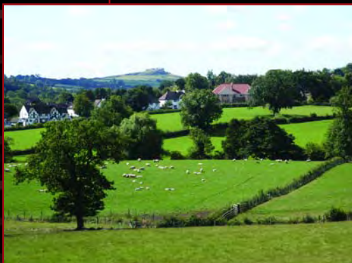
8. Almscliff Crag