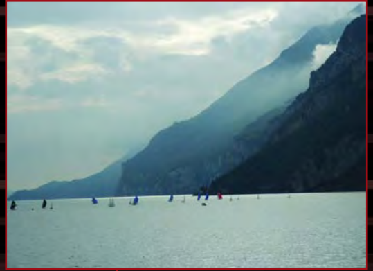
12. Lake Garda

www.betweennotes.co.uk www.matthewbarley.com www.frasertrainer.com