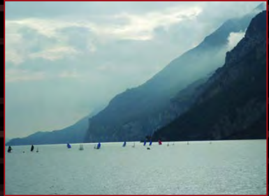
12. Lake Garda

www.betweennotes.co.uk www.matthewbarley.com www.frasertrainer.com