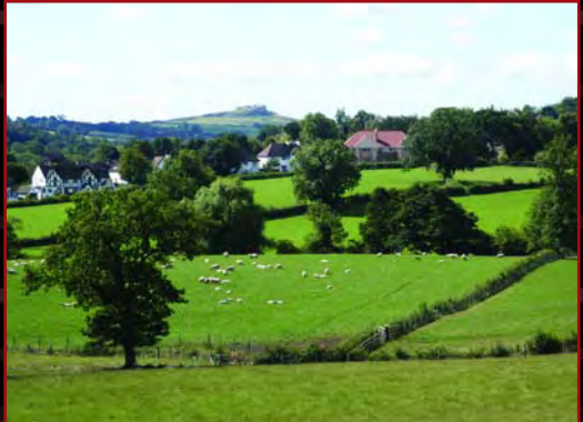
8. Almscliff Crag